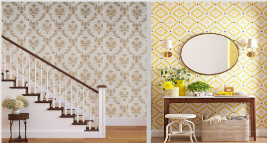
Backdrops are the great way to showcase the decor

4 rolls of wallpaper will be inclusive along with the installation