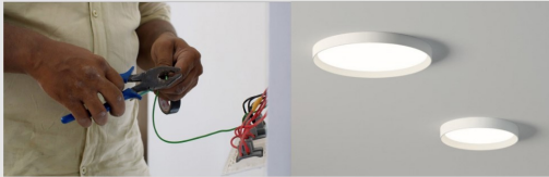
Electrical, false ceiling and lightings are interdependent inclusive of basic lightings, wires, and labour